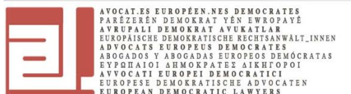
Avocats Européens Démocrates - European Democratic Lawyers