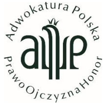
Poland / Polish Bar Council