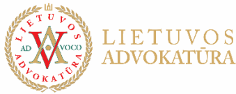
Lithuania / Lithuanian Bar Association