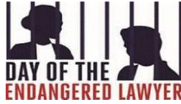
Foundation Day of the Endangered Lawyer